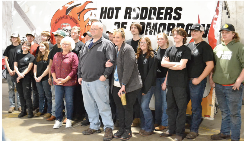
Donated trailer award presentation at the Indoor Nationals 2023.

Most recently, we partnered with the folks at Motorama Productions and awarded an 8x20 enclosed trailer to York County School of Technology that will be used exclusively by their Hot Rodders of Tomorrow program. That is a group of students that participate in engine building competitions around the country. I should note that they have two teams, and both of them finished in the top five in the country.